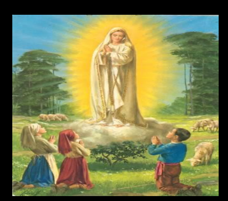
Catholics pray to Mary.