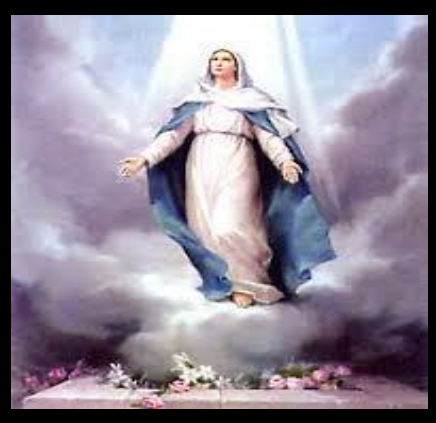
Body taken to heaven at the end of her life.