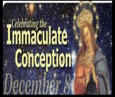
Born without original sin.